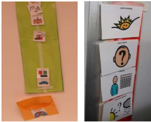
Figure 1: Paper-based visual schedules. (Left) Individual student schedules include representations for each activity of the day attached via Velcro. Students remove each item and place in the envelope to signify a start of an activity. (Right) Large cards representing activities to present to the class.