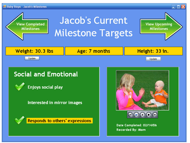
Figure 2: Sample screen shot of digital repository

milestone, rather than warning the parent about the potential of a disorder, it will alert them and add it to a list of questions they can print and bring to their pediatrician at their next scheduled visit.