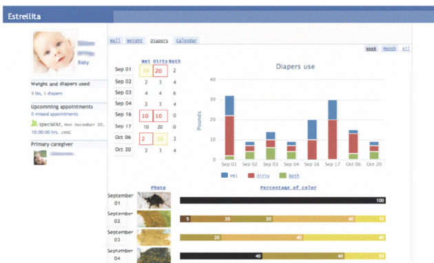
Figure 2. A screenshot of the Estrellita web portal, primarily designed for clinicians and other healthcare professionals. This particular page shows details about an infant’s diaper count, a graph of past diaper counts, and several system-generated color histograms for problematic diapers.