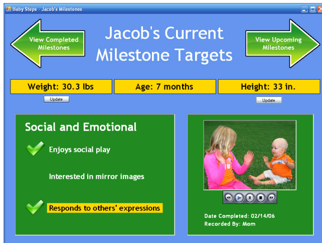
Figure 2: Sample screen shot of digital repository

milestone, rather than warning the parent about the potential of a disorder, it will alert them and add it to a list of questions they can print and bring to their pediatrician at their next scheduled visit.